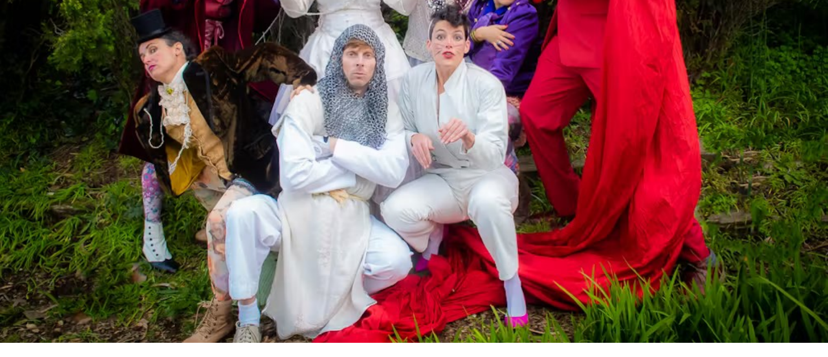
Travel alongside looking-glass creatures and queens as you follow the heroine through a wonderland (Golden Gate Park!) and meet favorite Carrollean characters like the Mad Hatter, the Tweedles, and others.