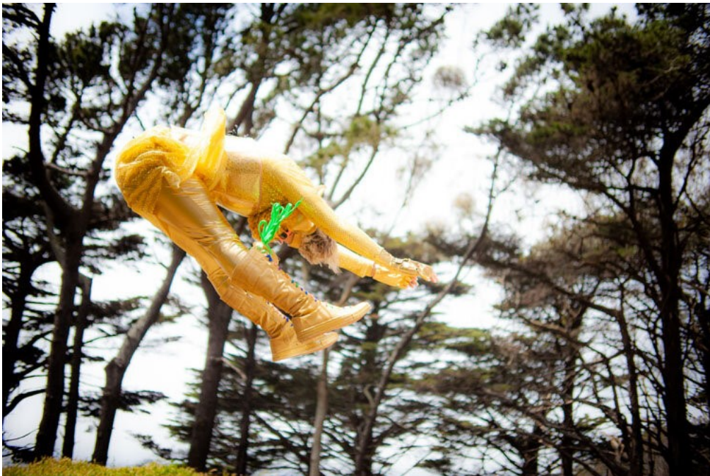
PSYCHOPOMP brings to life mythic creatures who support our journey through the unknown towards an unforeseeable future.